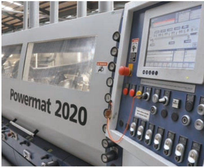
Powermat 2020 machine ensures quality cuts.