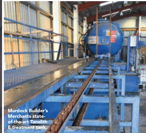
Murdock Builder's Merchants state-of-the-art Tanalith E treatment tank.