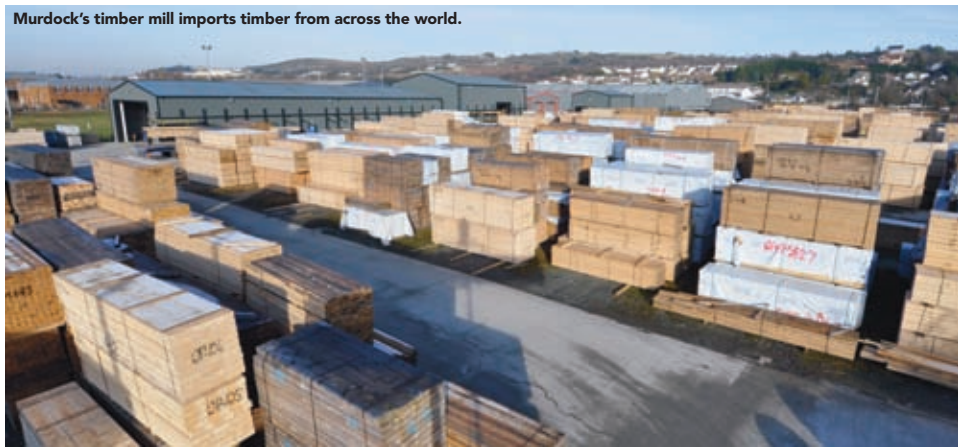
Murdock's timber mill imports timber from across the world.

awarded Chain of Custody Certification from the three leading certification bodies - FSC, PEFC and MTCS. Chain of Custody is a process that is designed to provide complete traceability and guarantees compliance with demands for ethically sourced timber products.