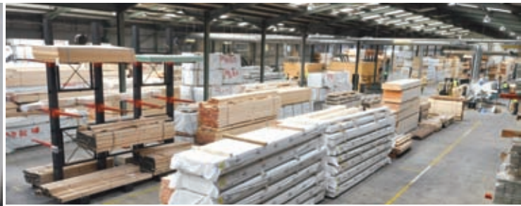
Murdock Builder's Merchants Warrenpoint timber mill, quality timber and the latest technology.