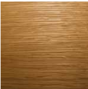
American White Oak

Many other species available in stock. Please contact us to discuss your requirements.