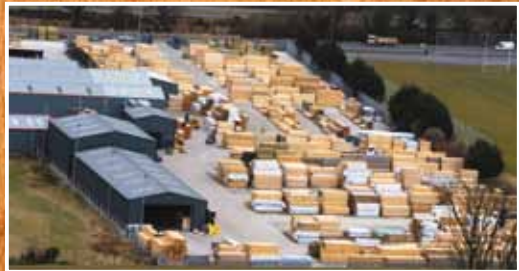
Cranwood Industries Newry

As part of our environmental policy both mills hold Chain of Custody Timber certifications for FSC, PEFC & MTCS.