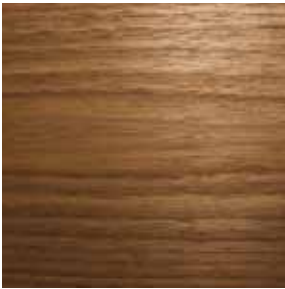
American Black Walnut