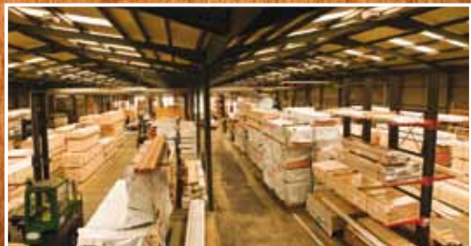
Cranwood Industries Warrenpoint